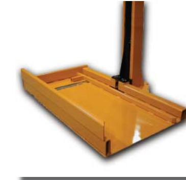
CUSTOM TOP PLATE Custom top plate includes a burn out for securing the wheels of the cart for stabilization.