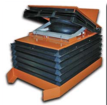
TOP PLATES Top plates can be designed to accommodate many different sized carts - carts as narrow as 27" between casters.