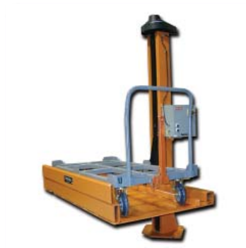
ERGONOMIC POSITIONING Position cart and contents in ideal ergonomic positioning so workers are more productive, and experience less back pain.