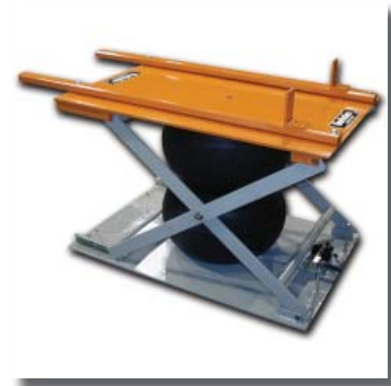
LIFT TOP CONFIGURATION Top plate steel bars close the gap between the bottom of the cart and top of the lift when needed. Stop gussets or retaining plates stabilize the cart and position it on the lift.