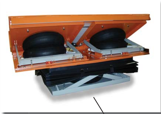
Dual tilt module for extra long rack. Olympic Lift and Tilt has the lowest profile at 8.25".