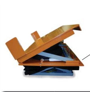
Dual captured track safely controls tilting angle and movement.

LIFT AND TILT High capacity lifting integrated with a tilt module positions material at the optimum height and angle.