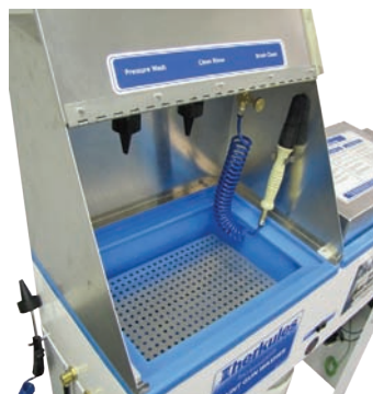
G520 manual cleaning tank

Enjoy thorough single-handed cleaning of EITHER waterborne or solvent paint guns with these two lightweight units. The Quick Clean G507, with its powerful pump, can go anywhere an airline can, while the G45 Fast Track Paint Gun Washer is powered by Herkules Sparkle Clean Blast, enabling portable pumpless cleaning practically anywhere.